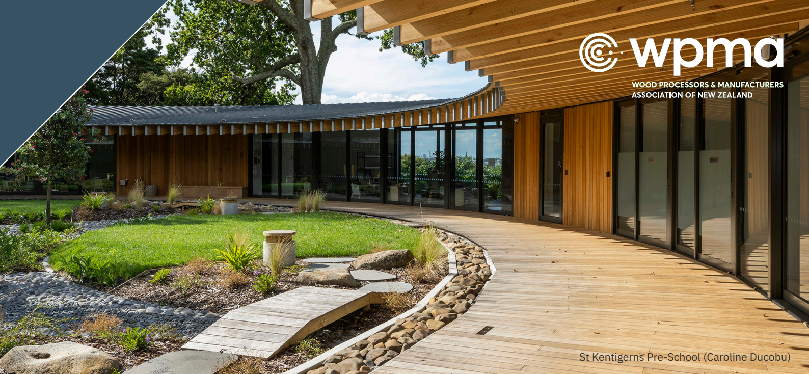
St Kentigern's Pre-School